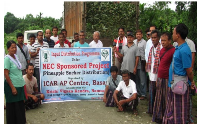
FIG 3 : Input distribution programme