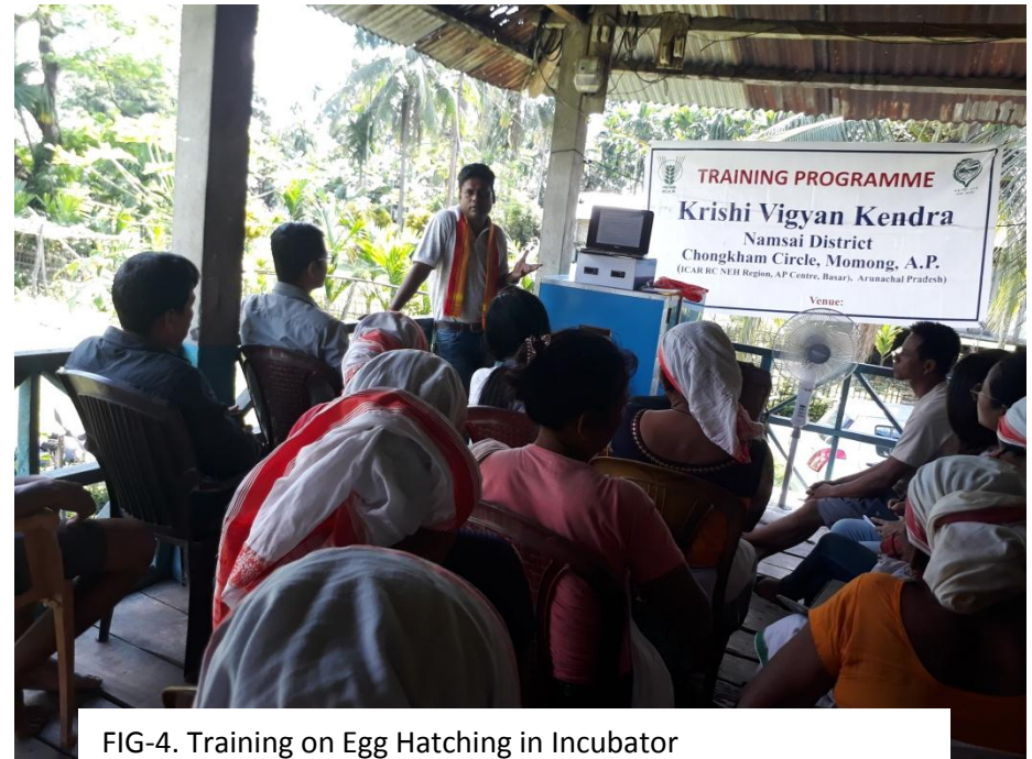
FIG-4. Training on Egg Hatching in Incubator