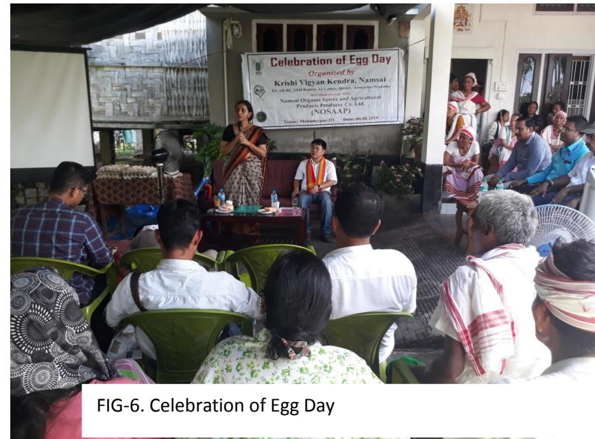
FIG-6. Celebration of Egg Day

After successful implementation of the technology, the KVK, Namsai and FPO – NOSAPP jointly organized field day in the form of celebration of “Egg day” to make aware and popularized the technology amongst the farming community as well as to line departments. In the programme, all the Head of Agri. and Allied department, DDM NABARD, Namsai & Changlang were present and Deputy Commissioner, Namsai acted as chief guest ( New Published: The Arunachal Times, August 10, 2019).