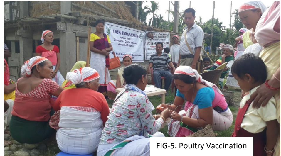
FIG-5. Poultry Vaccination

Furthermore, frequent visits by subject matter specialists to their units inspired confidence in them and gave them practical orientation in every aspect of management. Department of Animal Husbandry, Govt. of Arunachal Pradesh always offers their helpful hand to treat the birds as and when requires. Moreover, veterinary services were assured to them over a phone call.