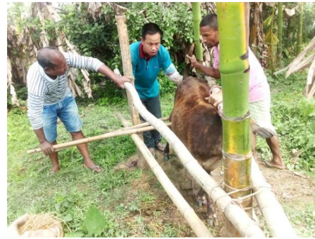
FIG 3 : Field Activity Performed by “A.I. Technician”